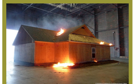
Photo 2. In order to be effective, external sprinklers must be able to wet all areas where ignition can occur, or be sufficiently effective in quenching embers that approach the home so they won't have enough energy to ignite combustible items.