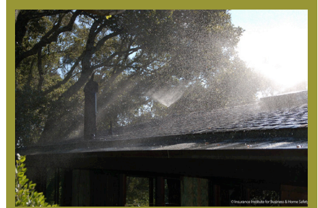
Photo 1. Roof mounted sprinkler.

Given the potential issues regarding performance, it's recommended that use be a supplement to, and not a replacement for, already proven mitigation strategies, such as the reduction of potential fuels throughout the home ignition zones, along with removal of roof and gutter debris, and use of noncombustible and fire/ember-ignition resistant building materials and installation design details.